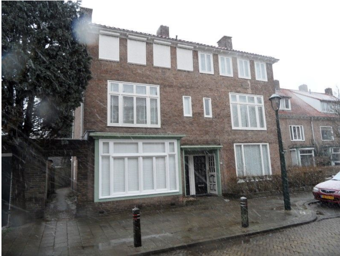
Sint Servaasweg 5614CC Eindhoven Rent per month € 1.295,- excl.