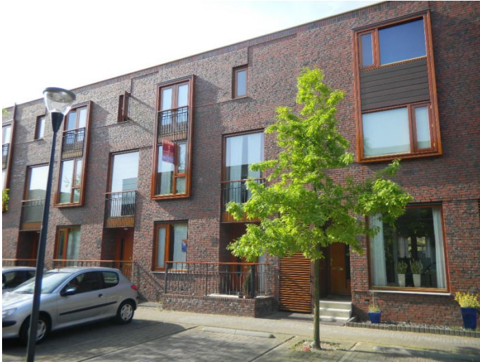
Grasmier 5658 GE Eindhoven Rent per month € 1.450,- excl.