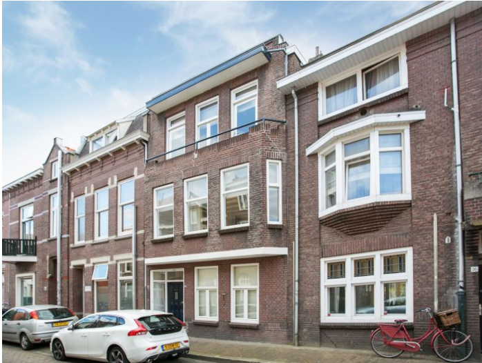
Prins Hendrikstraat 5611 HK Eindhoven Rent per month € 1.275,- excl.