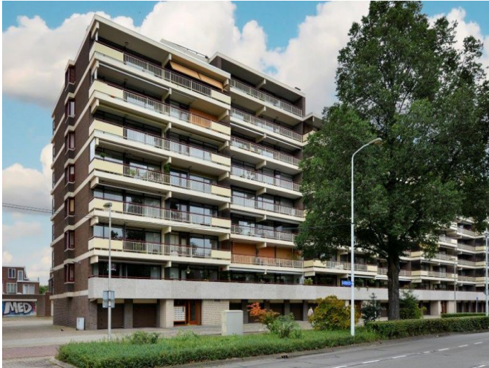
Veldmaarschalk Montgomerylaan 5612 BB Eindhoven Rent per month € 1.295,- excl.