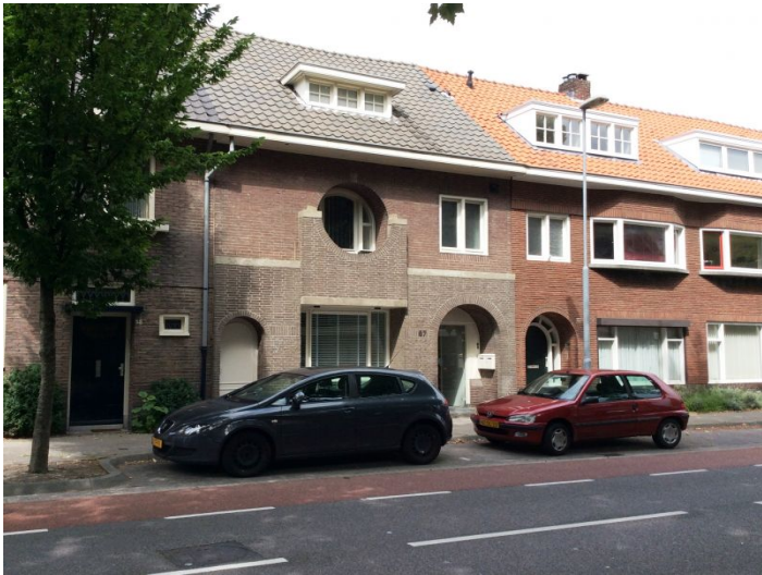
Tongelresestraat 5613 DB Eindhoven Rent per month € 1.275,- including energy