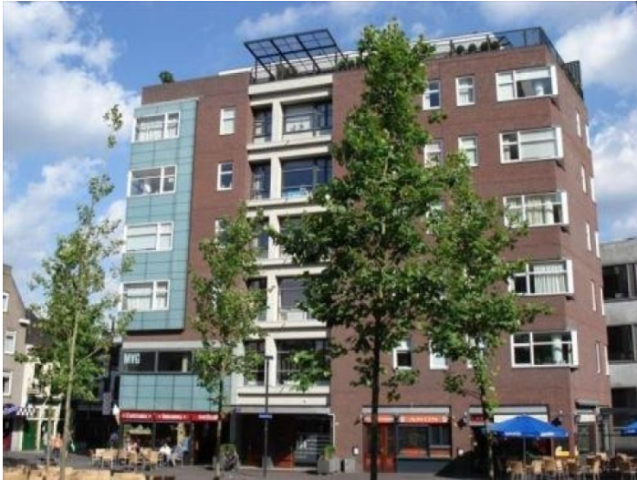
Begijnenhof 5611 EK Eindhoven Rent per month € 1.450,- excl.