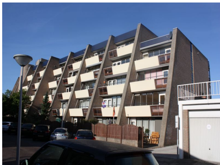
De Rozentuin 5611 SZ Eindhoven Rent per month € 990,- excl.