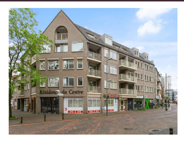
De Remise 5611 CX Eindhoven Rent per month € 1.300,- excl.