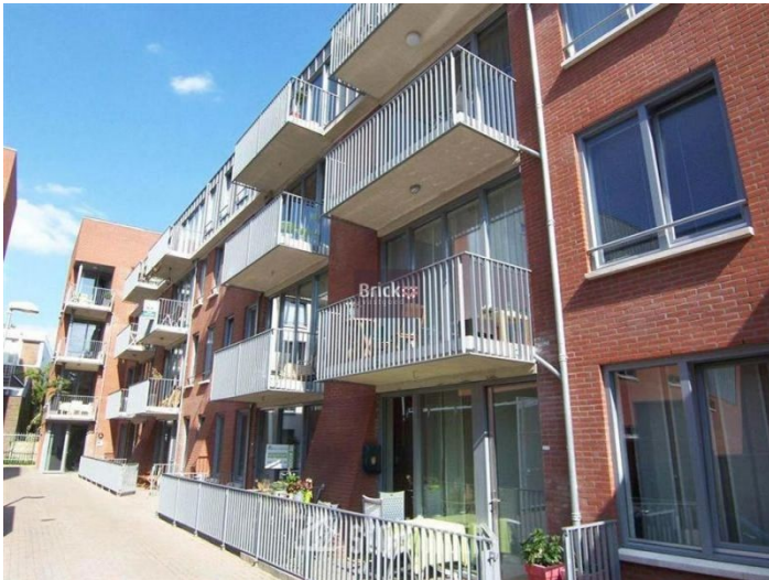
Stratumsedijk 5611 NA Eindhoven Rent per month € 1.450,- excl.