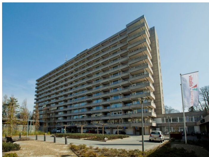
Herman Gorterlaan 5644SJ Eindhoven Rent per month € 550,- excl.