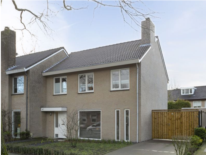
Edelweisslaan 5582 BW Waalre Rent per month € 2.000,- excl.