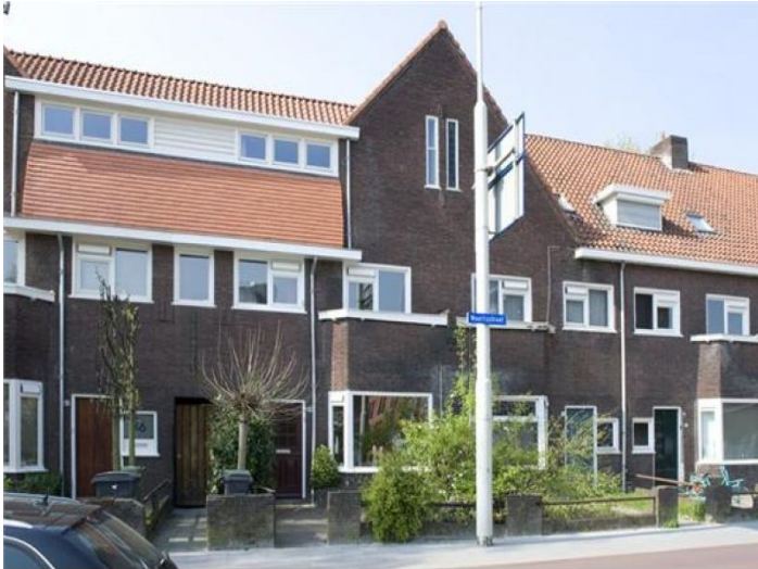
Mauritsstraat 5616 AB Eindhoven Rent per month € 1.595,- excl.