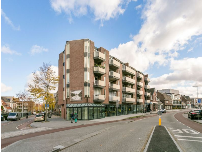
Methusalemplein 5611 VZ Eindhoven Rent per month € 1.600,- excl.